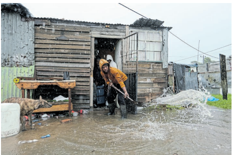
Several homes were flooded in Nelson Mandela Bay yesterday.

In KwaZulu-Natal, heavy winds caused structural damage in some areas.