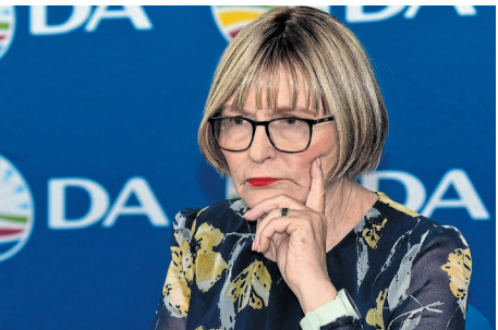
DA federal council chairperson Helen Zille

Daily Maverick this week reported Zille decided to make herself available after three high-profile individuals turned down the offer to become the DA’s candidate. It appears the DA believes it needs to field a high-profile candidate with a national footprint to successfully contest the Johannesburg mayoral chain. – TimesLIVE