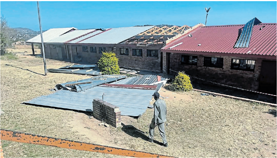
Sicelosetfu Secondary School had its roof blown off during the strong winds in Mpumalanga on Monday evening.